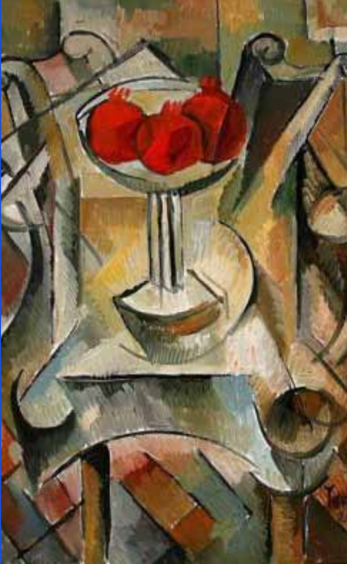
Still Life | 16" x 12" | Oil on Canvas