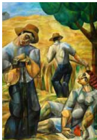
The Harvest II | 75" x 50" | Oil on Canvas