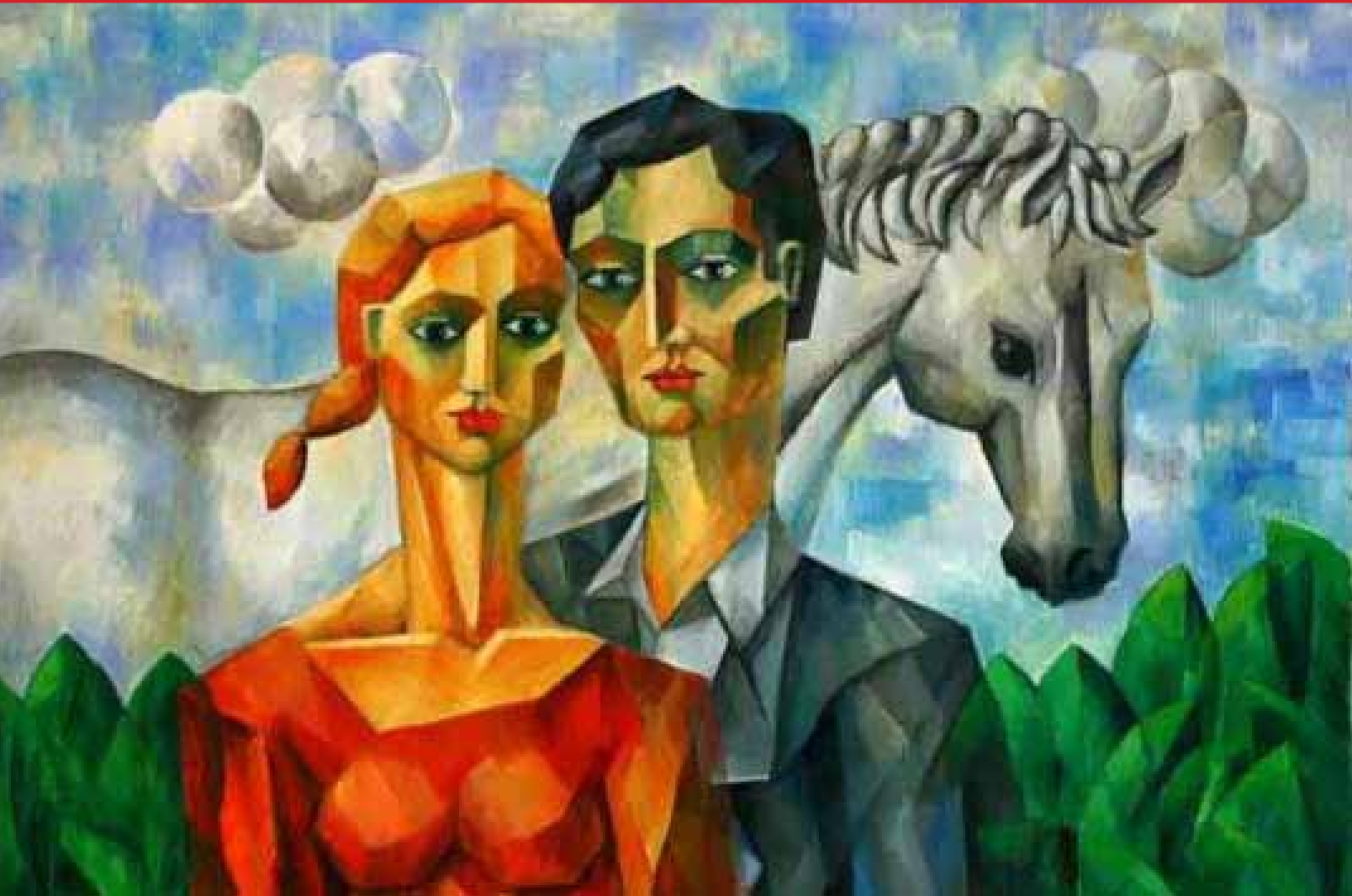
Lovers with White Horse II | 36" x 48" | Oil on Canvas