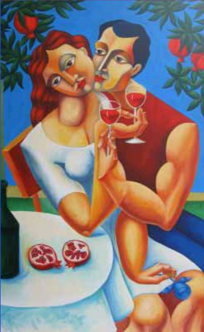
To Love | Serigraph on Canvas | 40" x 30"