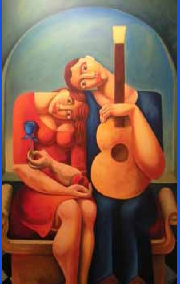
Together in Time | 46" x 30" | Serigraph on Canvas