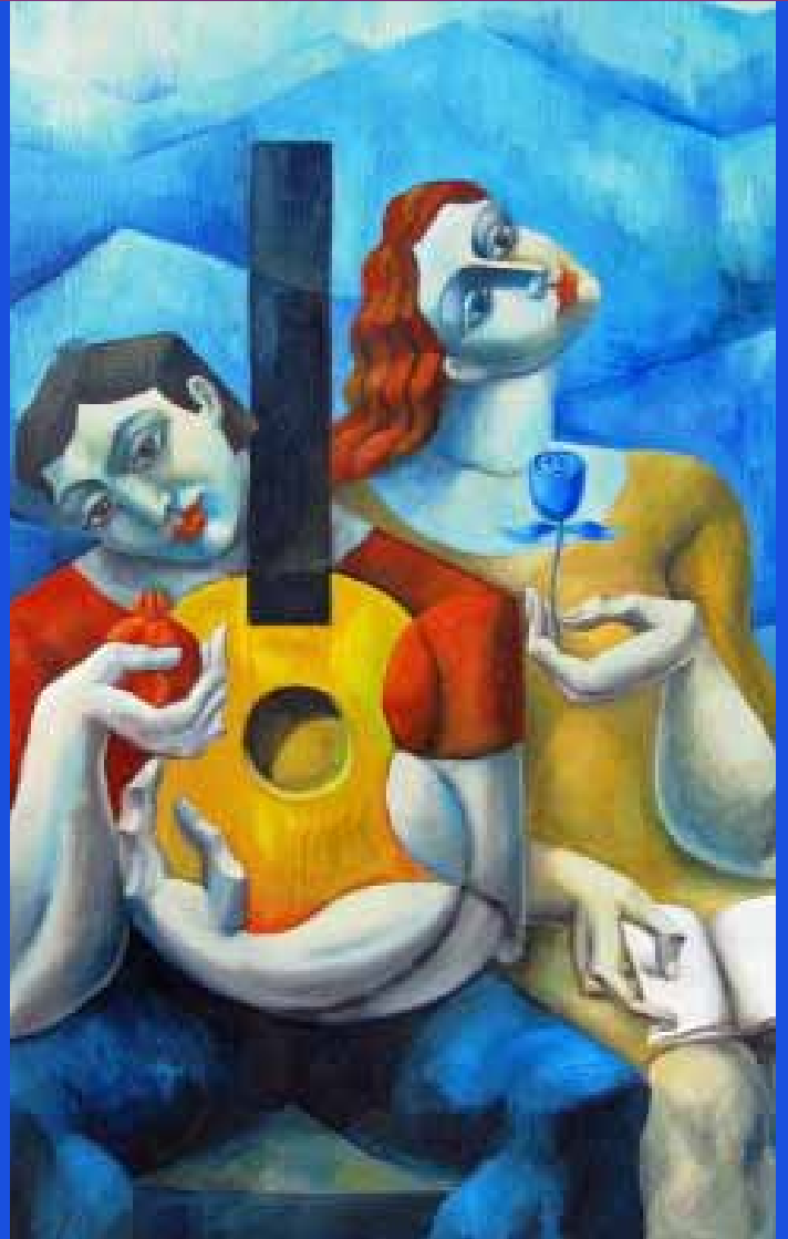
Music Between Lovers | Oil on Canvas | 42" x 30"