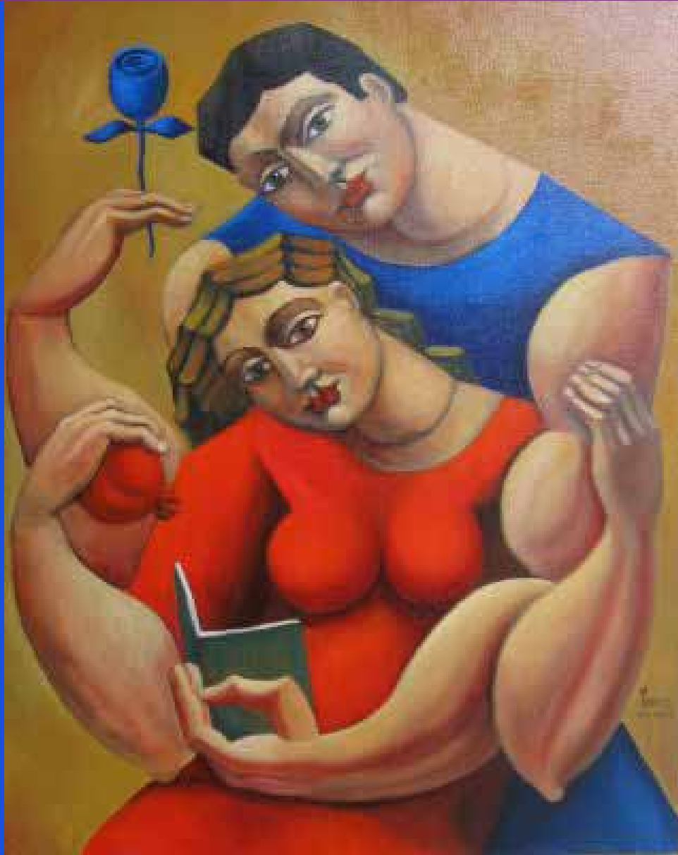
The Poetry of Love | Oil on Canvas | 30" x 24"