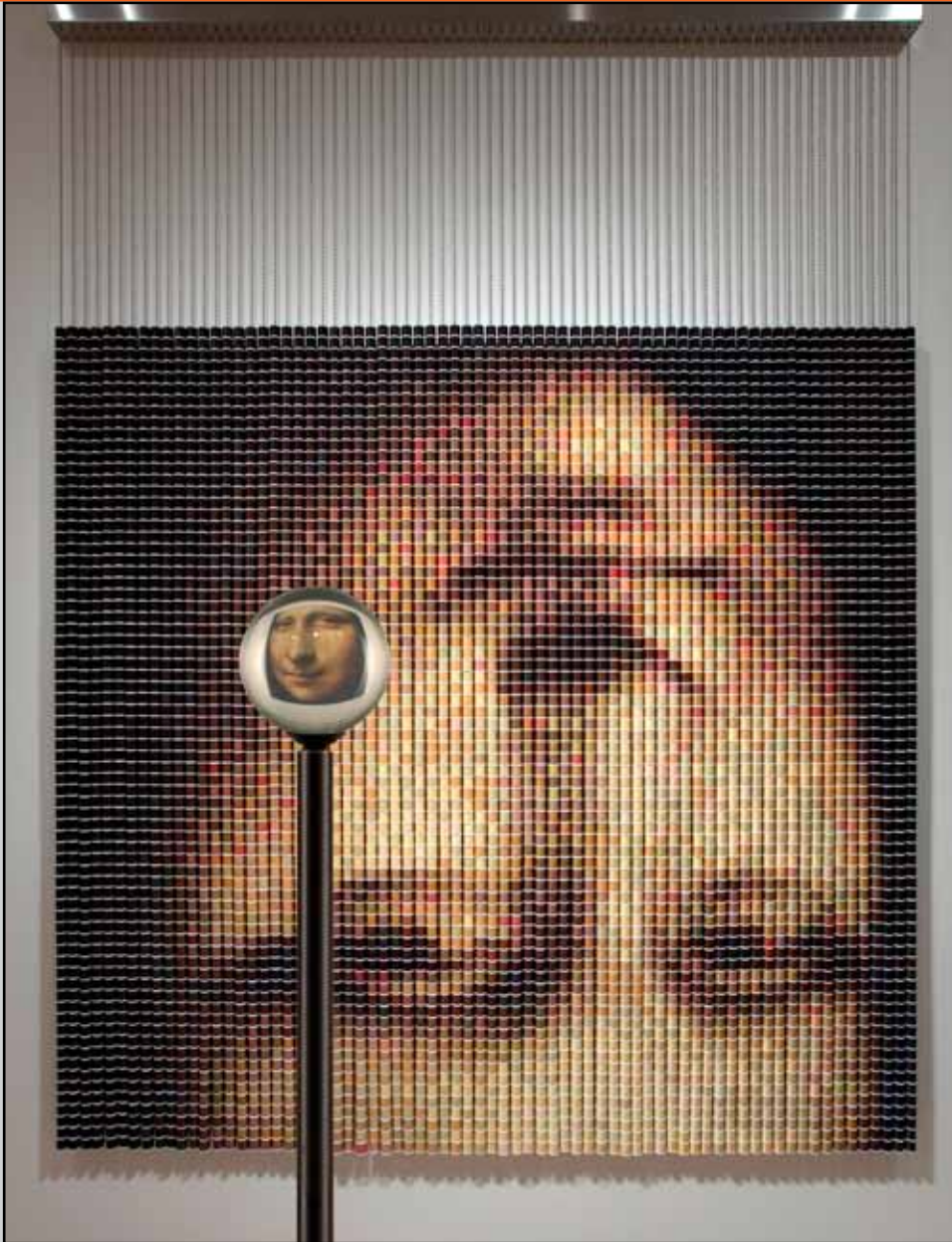
After the Mona Lisa 2 h 84.5" w 87.5" d 2" 5,184 spools of thread, aluminum ball chain and hanging apparatus, clear acrylic spheres, steel stand