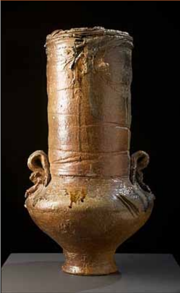
Salt Fired Vessel h 23.5 w 12.5" d 12.5" salt fired 1993