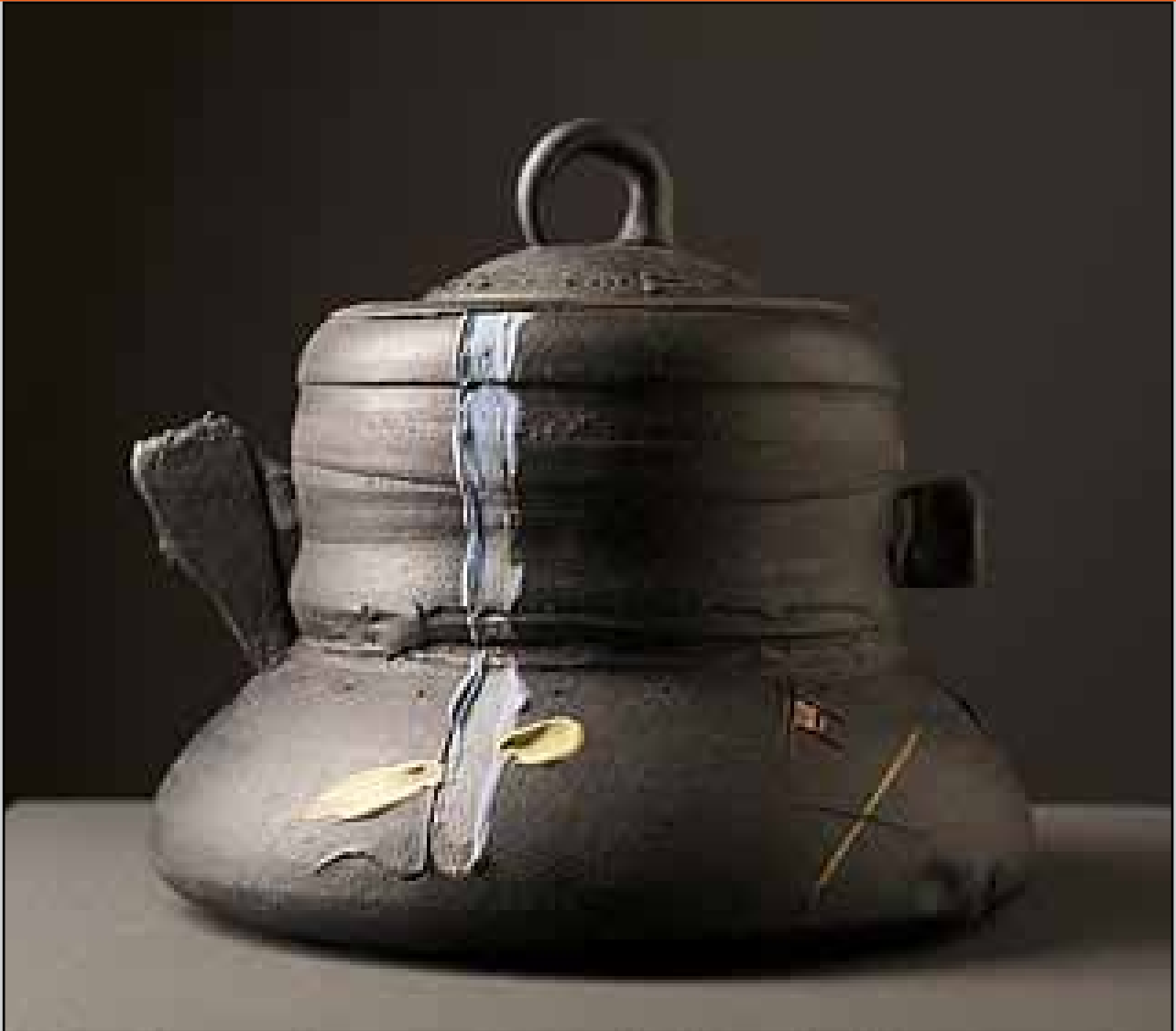
Three-Fingered Jar h 9.75 w 11.5" d 11" 06 black clay, salt 1987