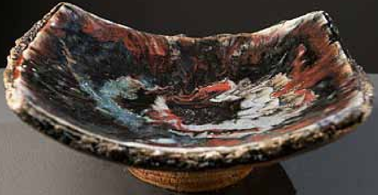
Nebula One h 4.5 w 12.25" d 10.25" woodfired cone 13 2011