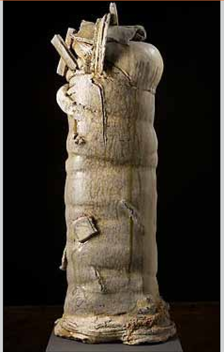
X-ceptional h 46 w 17" d 12.75" anagama woodfired 2011