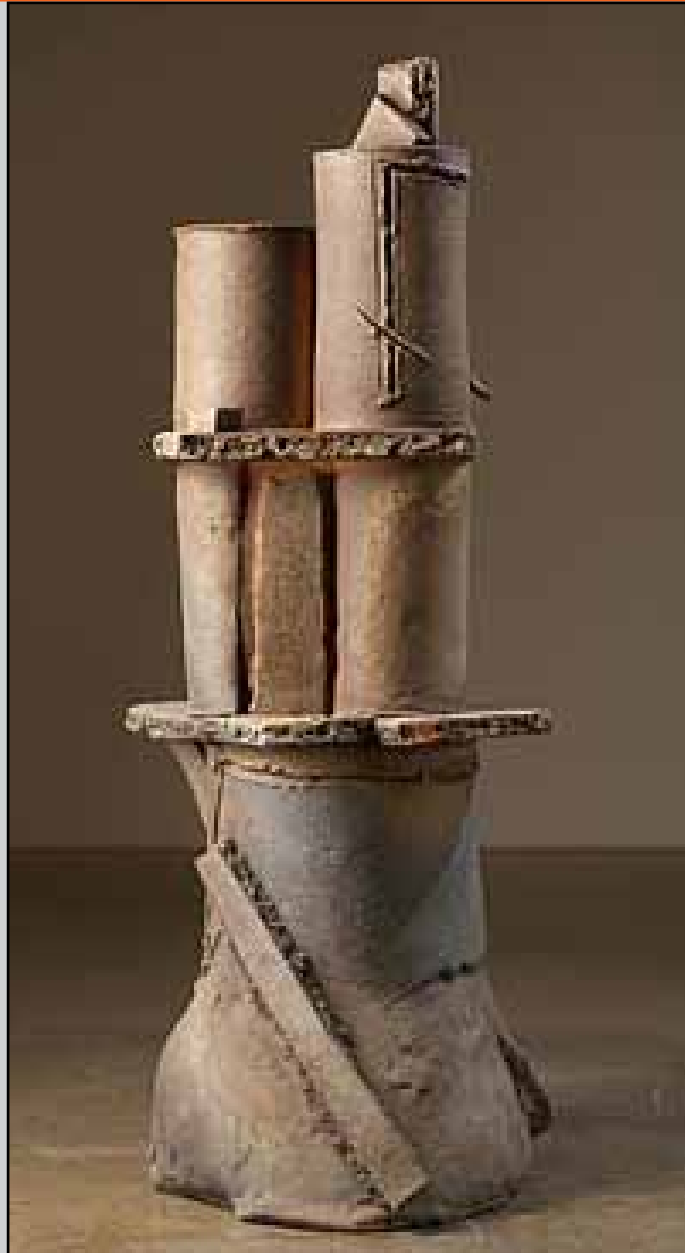
Potters Dream h 40 w 16" d 18" anagama woodfired 2007