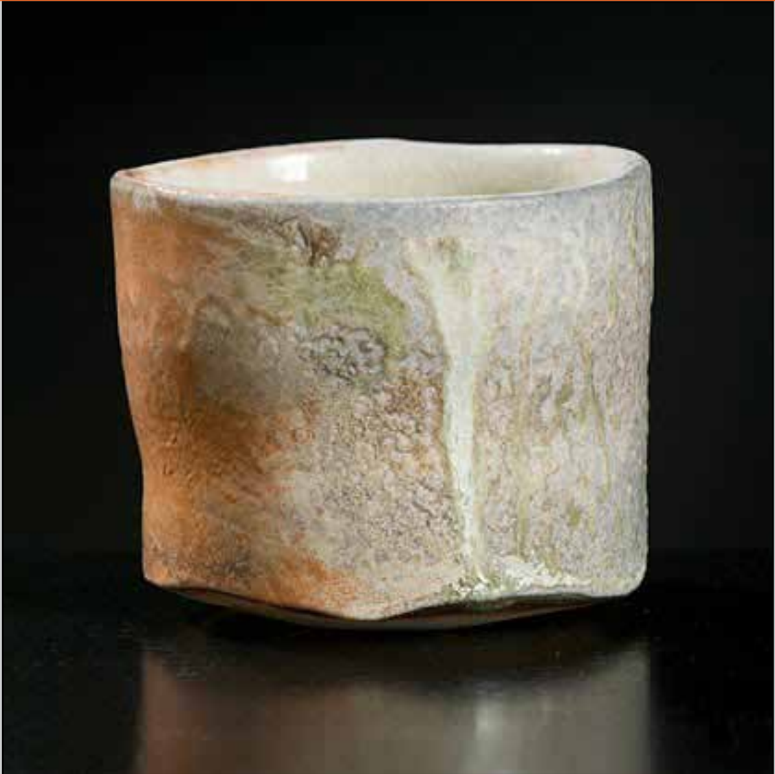
Teabowl 16 h 4.5 w 5.5" d 5.5" woodfired