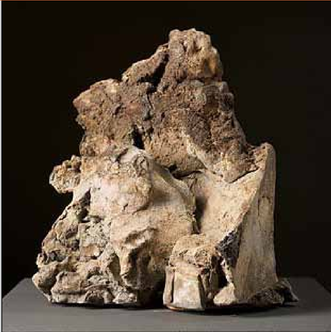
Suiseki Stones 2 h 11.25 w 15" d 12.5" anagama woodfired 2002