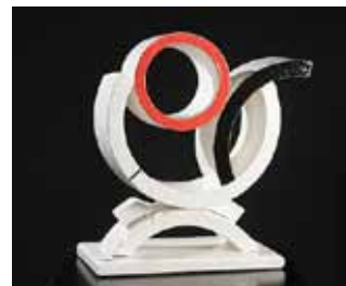
Sculpture 3 h 16 w 18" d 16"h multiple firing, woodfired cone 13, and low fire 2011

Time has enabled me to bring to my work a personal uniqueness, a clarification of purpose. These works serve as a bridge which allows me to move freely from one reality to another. In the interface I am free of convention, opinion, and burdensome history. My work becomes a personal iconography enabling me to visualize and organize my information. My marks are there in the clay, my signature.