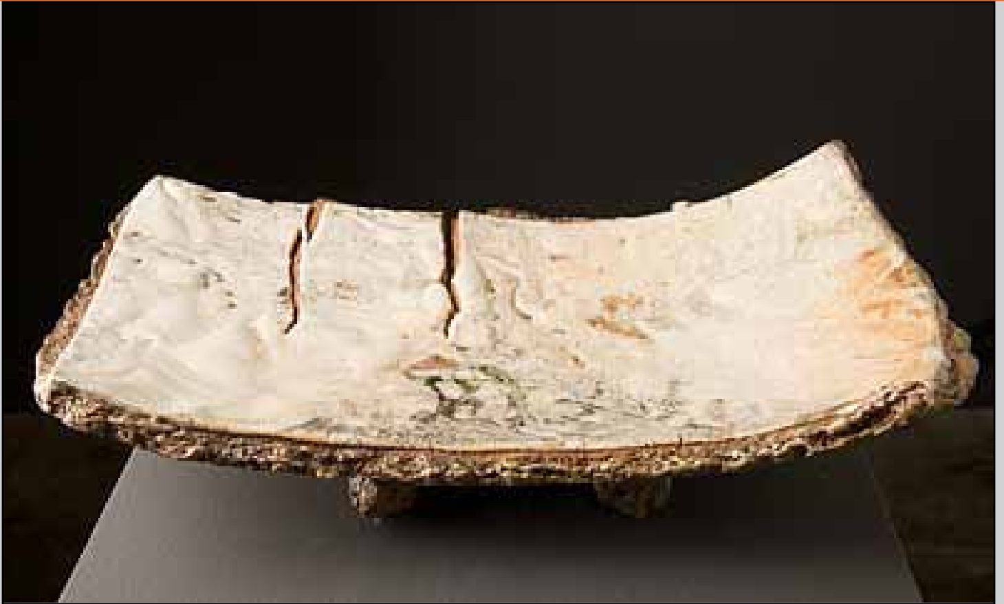
Shibui Platter h 5.5 w 20" d 11.25" woodfired cone 13 2009