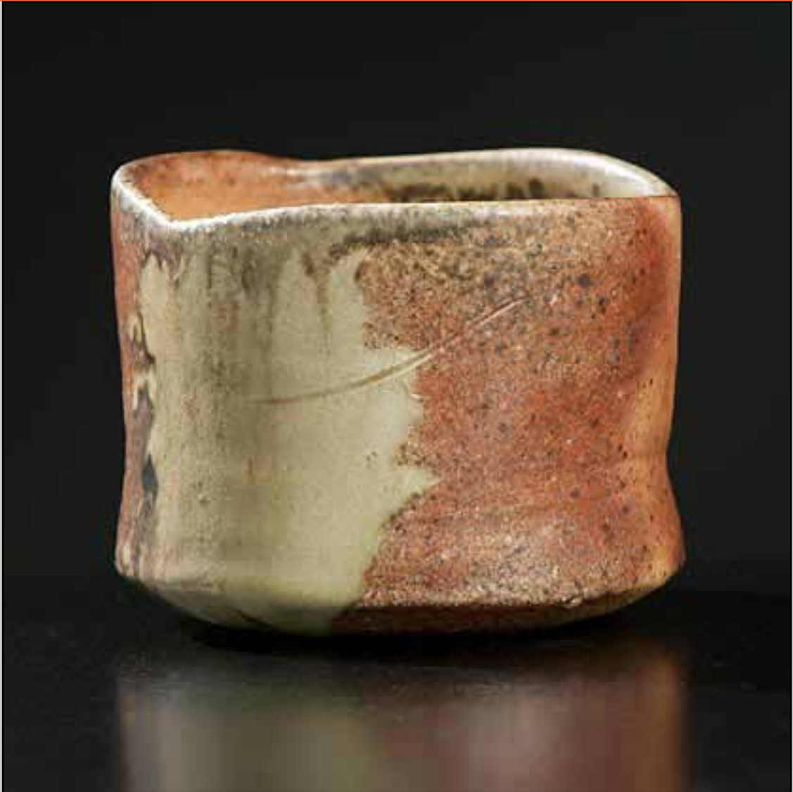
Teabowl 10 h 4.5 w 5.75" d 5.75" woodfired