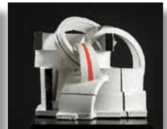
Sculpture 2 h 17.5 w 17.5" d 9.5" multiple firing, low fire 2011