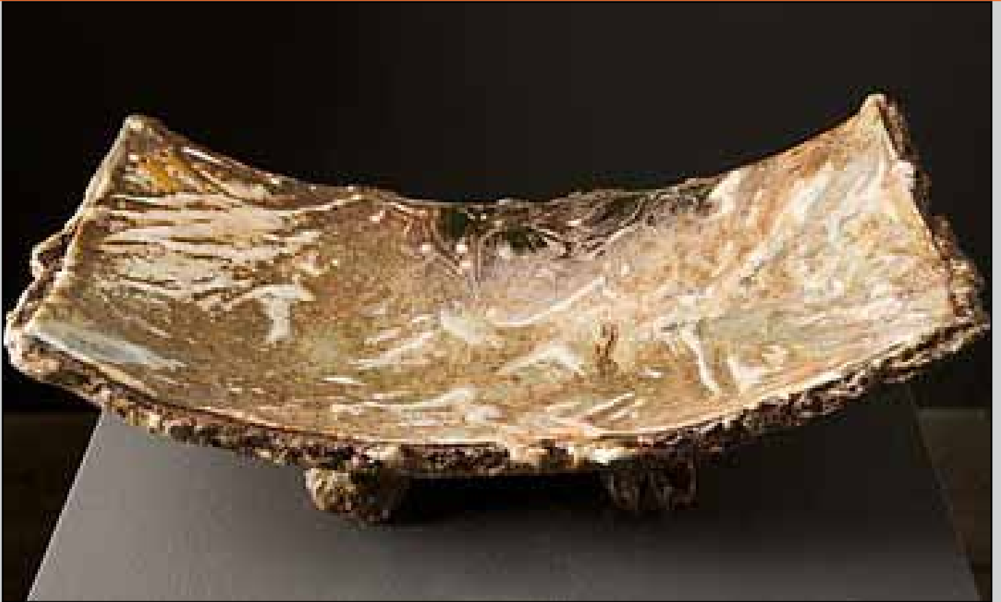
Coming of the Storm h 5.75 w 19" d 10.5" woodfired cone l3 2009