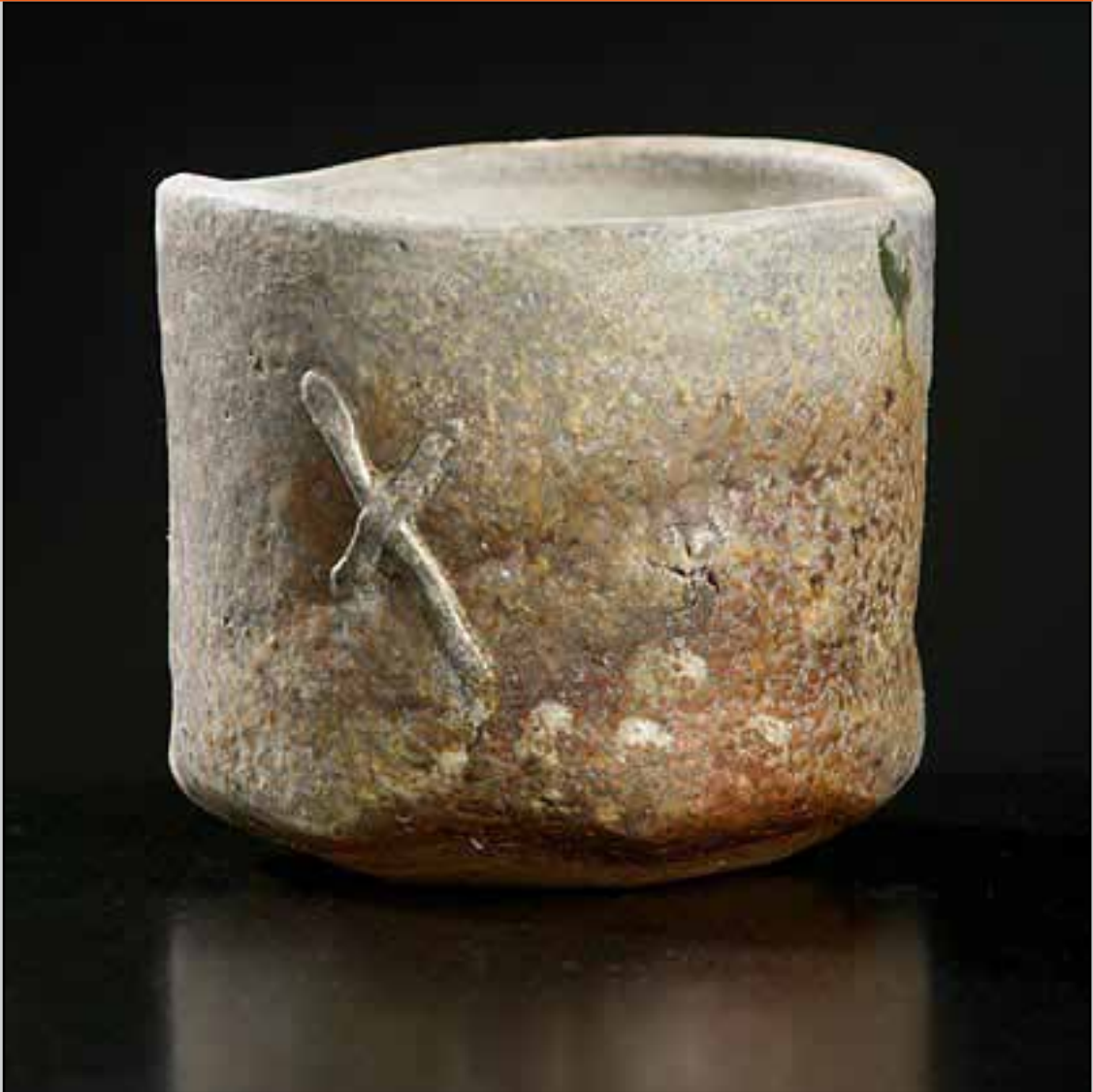
Teabowl 17 h 5 w 5.5" d 5.5" anagama woodfired